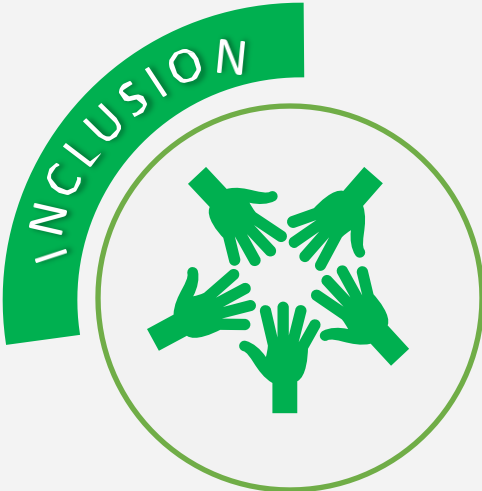
Inclusive Leadership Symposium