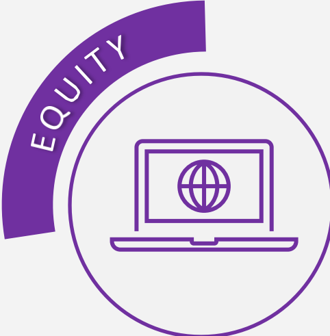
Redesigned Corporate Website & Presentation Template