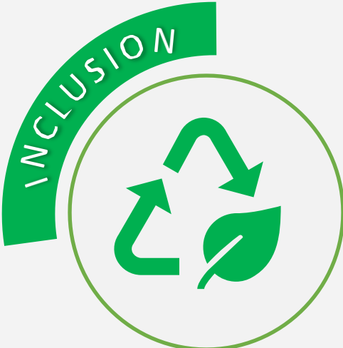
LEAD and Green Certified