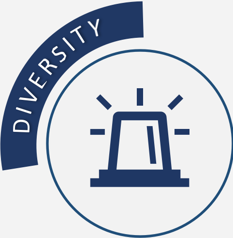
Harnessing Self-Awareness for Personal & Professional Development