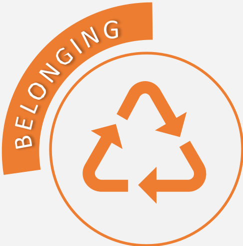
Zero Waste Strategy