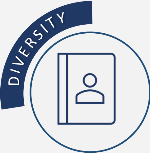
Supplier DEIB & Sustainability Initiative