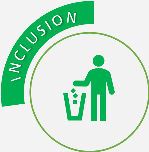
Green Initiative Analysis