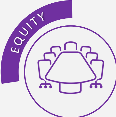
Driving Connections Through Employee Development in partnership with SkillCycle