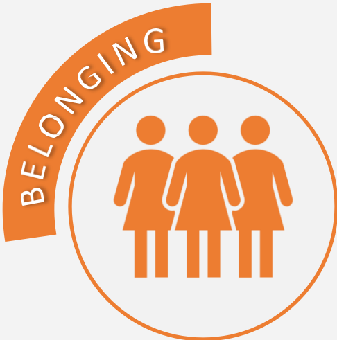
Our Purpose is Patients in collaboration with Ovarian Cancer Research Alliance (OCRA)